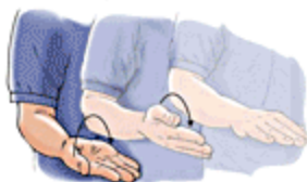
FOREARM PRONATION AND SUPINATION

5. FOREARM PRONATION AND SUPINATION: With your elbow bent 90°, turn your palm upward and hold for 5 seconds. Slowly turn your palm downward and hold for 5 seconds. Make sure you keep your elbow at your side and bent 90° throughout this exercise. Do 3 sets of 10.