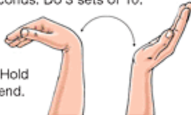
WRIST ACTIVE RANGE OF MOTION

C. Side to side: Gently move your wrist from side to side (a handshake motion). Hold for 5 seconds at each end. Do 3 sets of 10.