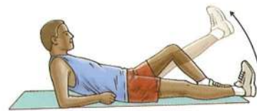
STRAIGHT LEG RAISE

4. STRAIGHT LEG RAISE: Lie on your back with your legs straight out in front of you. Bend one knee and place the foot flat on the floor. Tighten up the top of your thigh muscle on the opposite leg and lift that leg about 8 inches off the floor, keeping the thigh muscle tight throughout. Slowly lower your leg back down to the floor. Do 3 sets of 10 on each side.