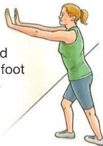
STANDING CALF STRETCH

2. STANDING CALF STRETCH: Facing a wall, put your hands against the wall at about eye level. Keep one leg back with the heel on the floor, and the other leg forward. Turn your back foot slightly inward (as if you were pigeon-toed) as you slowly lean into the wall until you feel a stretch in the back of your calf. Hold for 15 to 30 seconds. Repeat 3 times. Do this exercise several times each day.