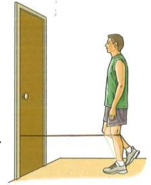
RESISTED TERMINAL KNEE EXTENSION

8. RESISTED TERMINAL KNEE EXTENSION: Make a loop from a piece of elastic tubing by tying a knot in both ends, and closing both knots in a door. Step into the loop so the tubing is around the back of one leg. Lift the other foot off the ground. Hold onto a chair for balance, if needed. Bend the knee on the leg with tubing about 45 degrees. Slowly straighten your leg, keeping your thigh muscle tight as you do this. Do this 10 times. Do 3 sets. An easier way to do this is to perform this exercise while standing on both legs.