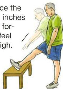
STANDING HAMSTRING STRETCH

1. STANDING HAMSTRING STRETCH: Place the heel of your leg on a stool about 15 inches high. Keep your knee straight. Lean forward, bending at the hips until you feel a mild stretch in the back of your thigh. Make sure you do not roll your shoulders and bend at the waist when doing this or you will stretch your lower back instead. Hold the stretch for 15 to 30 seconds. Repeat 3 times for each leg.