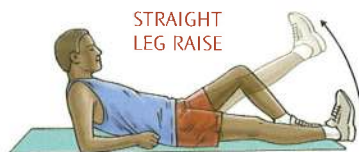
STRAIGHT LEG RAISE

4. STRAIGHT LEG RAISE: Lie on your back with your legs straight out in front of you. Bend one knee and place the foot flat on the floor. Tighten up the top of your thigh muscle on the opposite leg and lift that leg about 8 inches off the floor, keeping the thigh muscle tight throughout. Slowly lower your leg back down to the floor. Do 3 sets of 10 on each side.