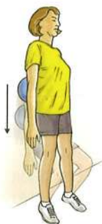
WALL SQUAT WITH A BALL

2. QUADRICEPS STRETCH: Stand an arm's length away from the wall, facing straight ahead. Brace yourself by keeping one hand against the wall. With your other hand, grasp the ankle of the opposite leg and pull your heel toward your buttocks. Don't arch or twist your back. Keep your knees together. Hold this stretch for 15 to 30 seconds. Repeat 3 times on each side.