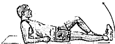
Straight leg raise