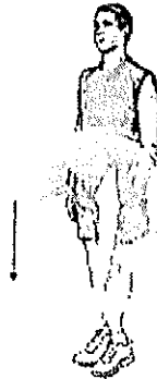
Iliotibial band stretch (standing)